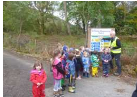
Learning about our community Hydro scheme whilst on our annual Arrochar Challenge sponsored walk