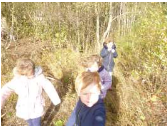
Having fun, learning about weather on a frosty day

This establishment will ensure that no child is excluded or disadvantaged because of ethnicity, religion, culture, family background, disability, gender, home language, additional support needs, rurality or ability. We will ensure that all children feel secure, included and valued. These principles are reflected in our admissions criteria and throughout the planned curriculum.