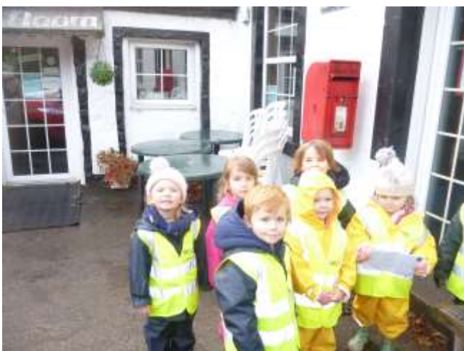
Posting letters to Santa!

Every child is entitled to a broad and deep general education, whatever their level and ability. Every single teacher and practitioner will be responsible for literacy and numeracy – the language and numbers skills that unlock other subjects and are vital to everyday life. It develops skills for learning, life and work to help young people go on to further study, secure work and navigate life. It brings real life into the classroom, making learning relevant and helps young people apply lessons to their life beyond the classroom. It links knowledge in one subject area to another, helping children understand the world and make connections. It develops skills so that children can think for themselves, make sound judgements, challenge, enquire and find solutions.