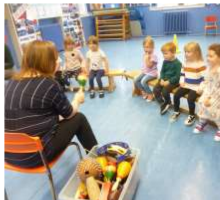
Our monthly music workshop with Snappy Sounds