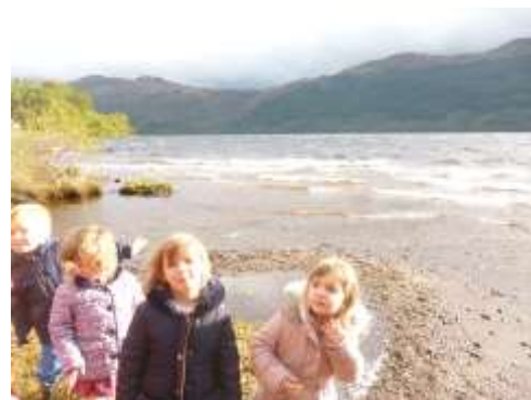
Collecting items for 'story sticks', on the shore, when the story teller visited