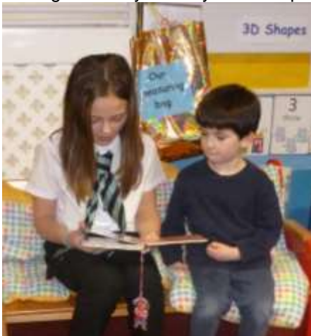
Listening to a story read by an older pupil