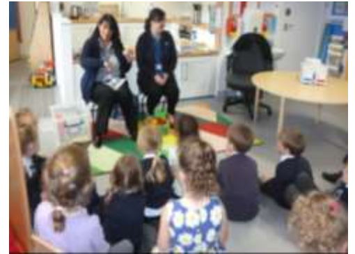
Learning about oral health from the Oral Health Team, with P1

Ultimately, Curriculum for Excellence aims to improve our children's life chances, to nurture successful learners, confident individuals, effective contributors and responsible citizens, building on Scotland's reputation for great education.