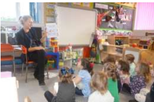
Liaison with P1

Along with your child's end of year report from the pre-school staff, you may also request a copy of any information that is passed to the primary school.