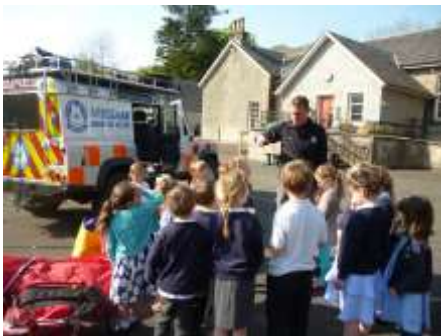
A visit from the mountain rescue service

Ultimately, Curriculum for Excellence aims to improve our children's life chances, to nurture successful learners, confident individuals, effective contributors and responsible citizens, building on Scotland's reputation for great education.