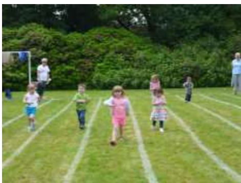
Sports Day fun